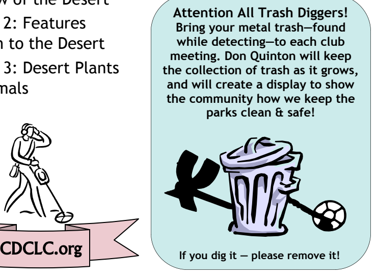
Coil & Diggers Club February 2007