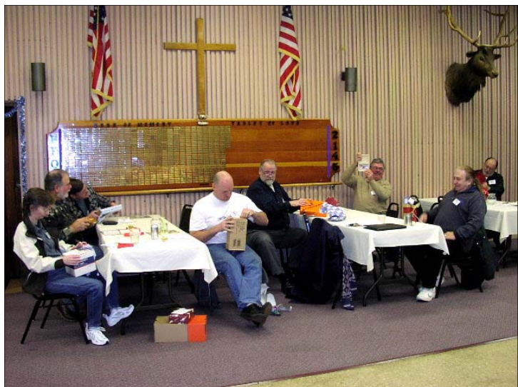
Everyone received a gift at the party!