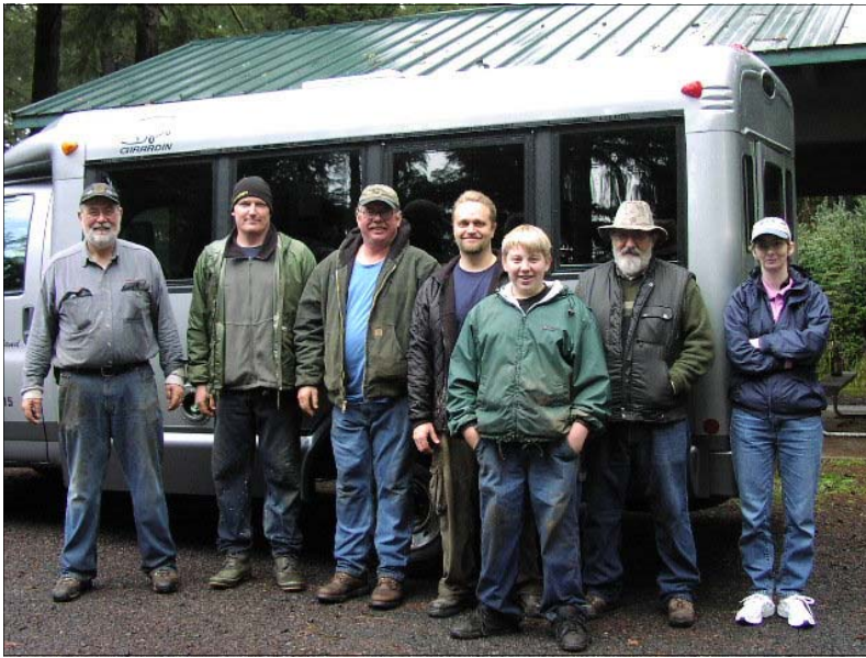
A Pretty Soggy Crew