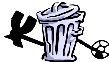
If you dig it – please remove it!